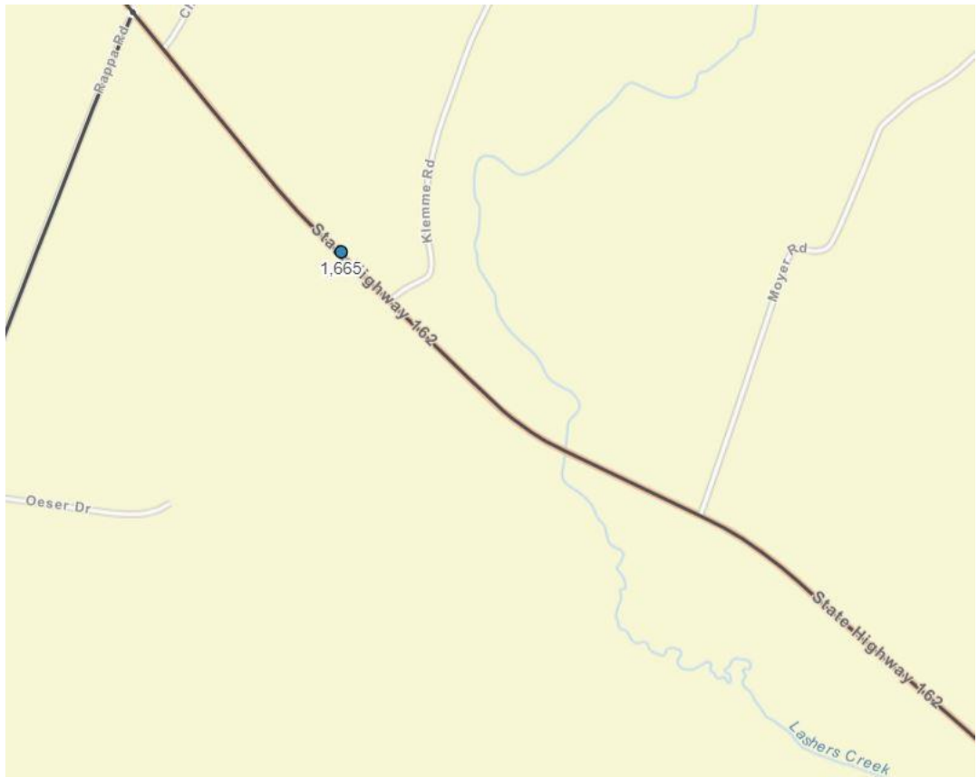
Above: AADT SR 162