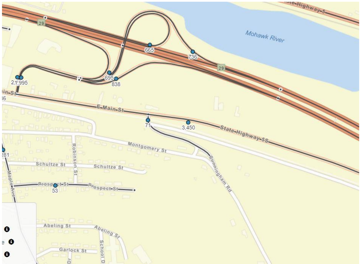
Above AADT 5s/Cunningham Road