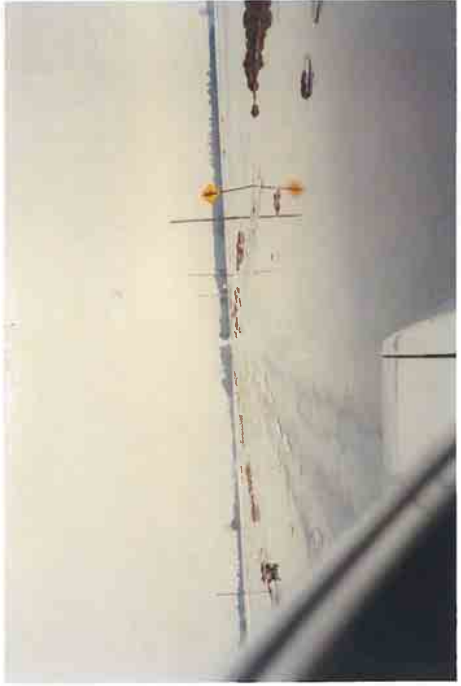
Photograph of the Flooded Intersection between [REDACTED] Lambton Shores