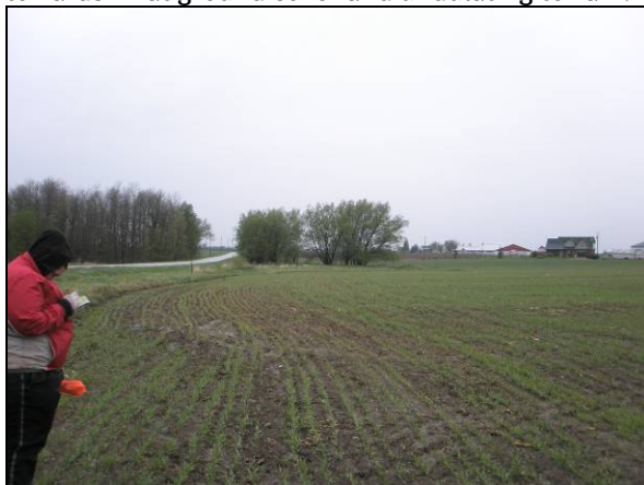
Plate 9: View west-northwest along 14th Line at ground cover (wheat) and terrain.