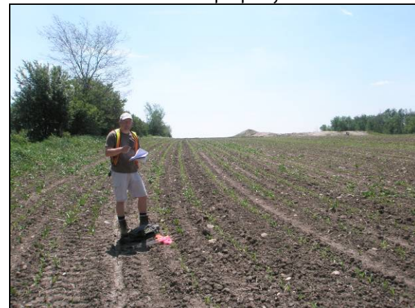
Plate 12: View south-southwest across project study area towards T10 and 14th Line.