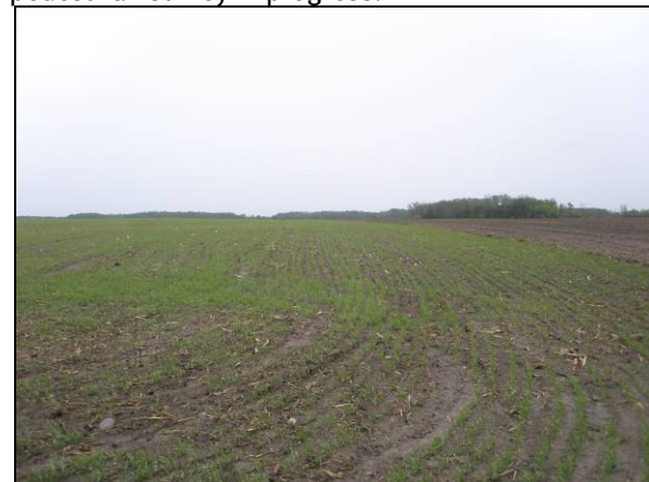
Plate 10: View north-northeast across assessed field towards unassessed property near T9.