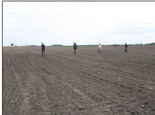
Plate 8: View north-northeast from treeline to T1 at pedestrian survey in progress.