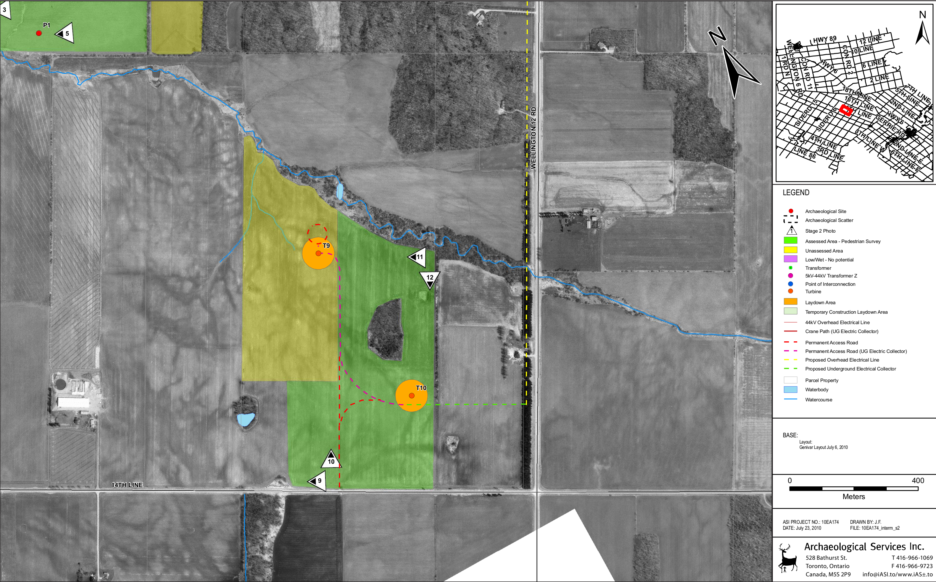
Figure 2: Next Era Conestogo Wind Farm (10EA-174) Stage 2 Assessment Results (Sheet 2)