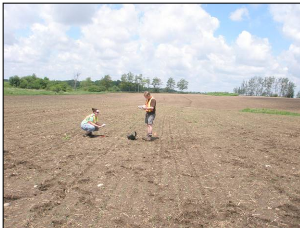
Plate 5: View west-northwest at findspot P1.