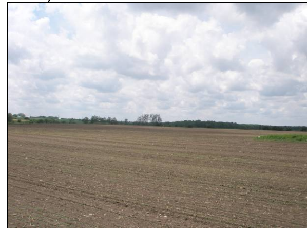
Plate 4: View west across project study area towards Site H1 at flat terrain.