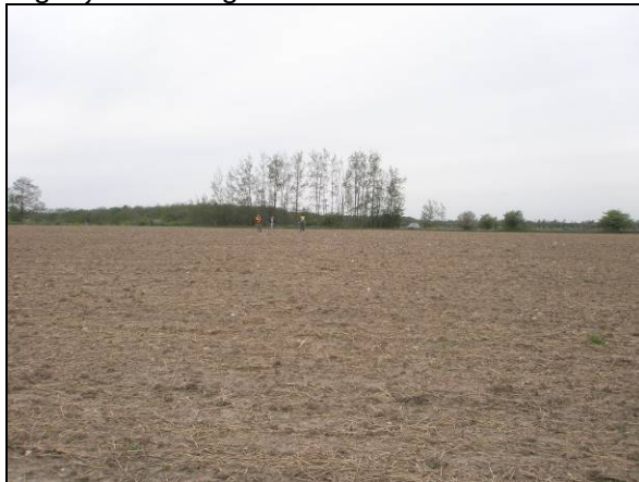
Plate 3: View west-northwest across Site H1 towards Sideroad 6.