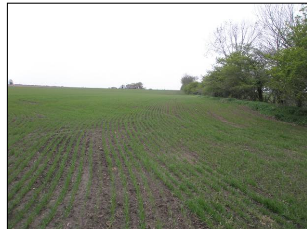
Plate 6: View south-southwest across flat terrain towards farm property (outside project study area).