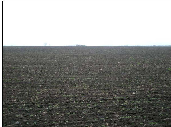
Plate 2: View northeast across temporary laydown area adjacent to Sideroad 6.