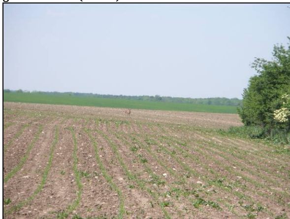
Plate 11: View west-northwest along northern limit of assessed property along 14th Line at gently sloping terrain and wildlife.