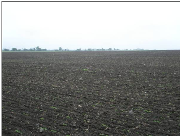
Plate 1: View north across project study area at slightly undulating terrain.