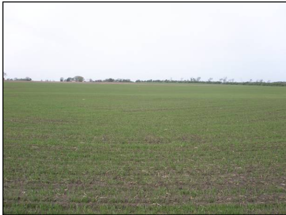
Plate 7: View west-southwest across location of T8 towards T7 at ground cover and undulating terrain.